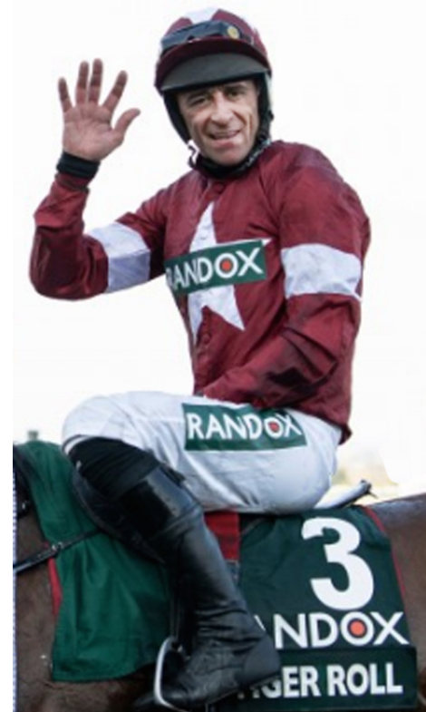
Davy Russell on Tiger Roll after one of their Grand National wins.

He said: "You always wonder after a bad fall whether you still have it. I wanted to come back riding because recovery would've been an awful lot more difficult unless I had a goal." And he wanted to go out on a winner.