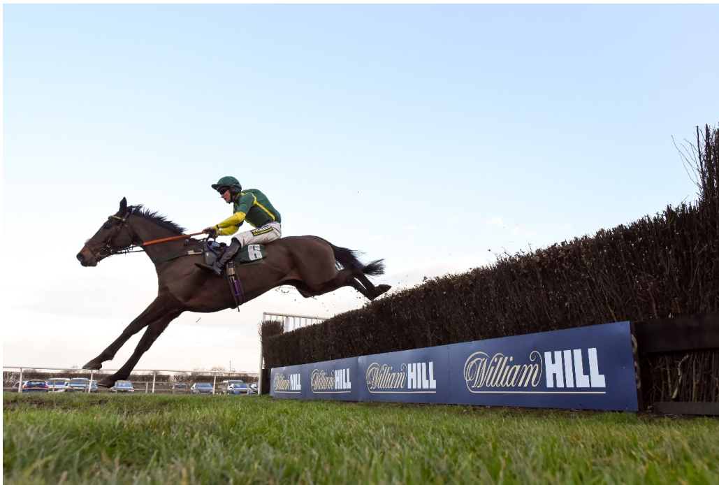
Grand National at Catterick.