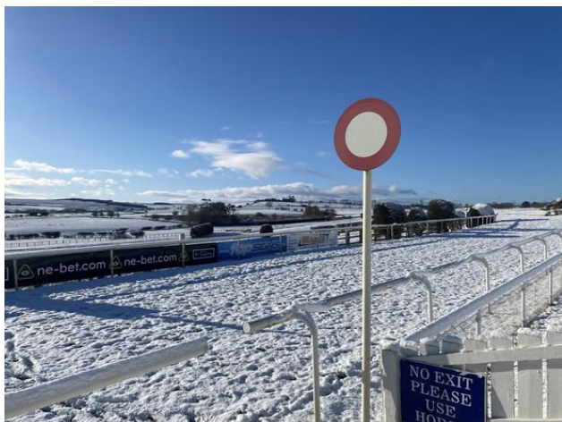
Photo below – Hexham covered by snow in November 2025 – its not always like this though!!

Hexham Racecourse Annual Membership offers great value to regular racegoers and is available now for 2026.