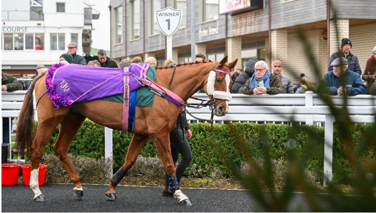
Hurdle Race sponsored by Heineken Ltd, is scheduled for 1.45pm.

Catterick Racecourse is gearing up for a spectacular festive season, with three National Hunt fixtures set to bring excitement, thrilling racing and Christmas cheer to racegoers on Tuesday 16 December, Sunday 28 December and New Year's Day. With seasonal entertainment, special giveaways and quality racing on offer, the racecourse is encouraging visitors to book early and make the most of its advance ticket savings.