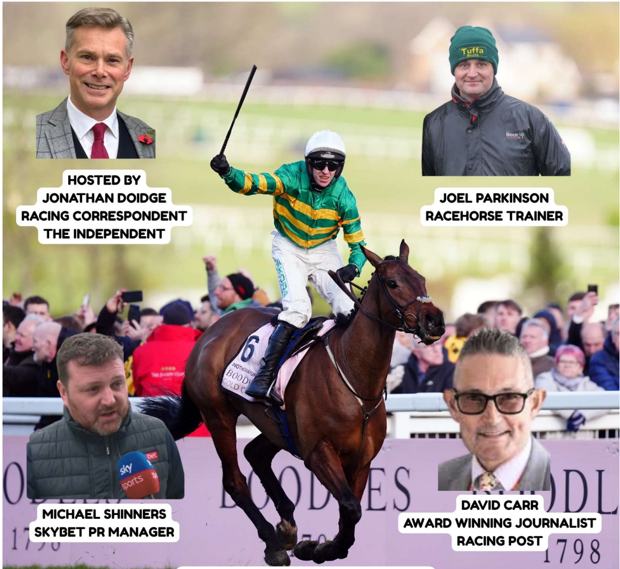
HOSTED BY JONATHAN DOIDGE RACING CORRESPONDENT THE INDEPENDENT